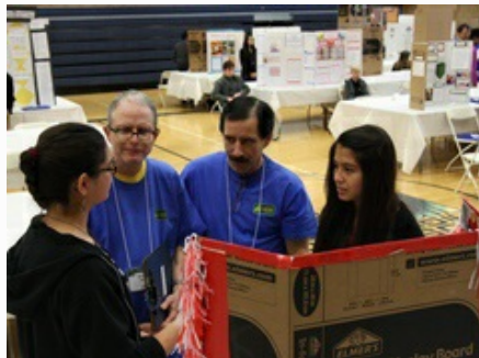
Judges at the 2014 Fair, interviewing a couple of participants

Join the greater Northern California region in encouraging and inspiring our future scientists, technology experts, engineers, mathematicians and more! Support our program by volunteering as a judge today! See "STEM professionals-to-be" experiment and design projects that expose new ideas and have a chance to discuss content, development, and design with these future scientists and engineers.